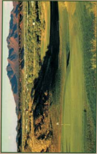
Great golf in a natural setting.

San Pedro Golf Course is an 18-hole championship facility located on the banks of the San Pedro River. The golf links winds through mesquite groves and along the banks of the San Pedro on the front nine. The back nine traverses through canyons and elevation changes, concluding with the 457-yard par four, "twin lakes" 18th hole.