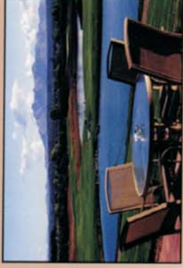
Our terrace provides the perfect spot for watching golfers finish the 18th hole.

After a memorable round of golf, we have the perfect place to relax and recount your round. The Ironwood Grill at San Pedro Golf Course offers full-service dining facilities to meet your every need. The Ironwood Grill is available for special events, including weddings, receptions, meetings and reunions.