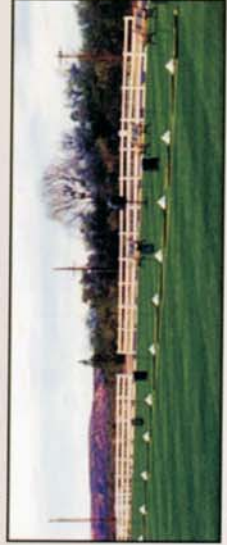
The largest all turf practice facility in the southwest